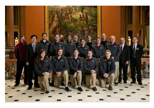
The 9-time National Champion Flying Salukis were recognized for their accomplishments recently at the State House.

The proposed reduction is about $32 million for SIU Carbondale, resulting in a state funding level last received in the mid 1980's.